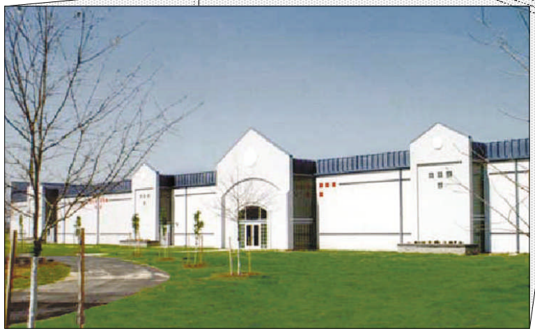
64,000 Square Foot Available Industrial Building Located on 10 Acres with Expansion Capability up to 120,700 square feet

10 Miles to Vicksburg ← Interstate 20 → 30 Miles to Jackson